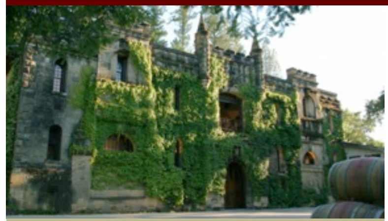
The strikingly beautiful Chateau Montelena in Calistoga, Napa Valley

May Day, May Day...mark your calendars. This month is chock full of holidays, from the Kentucky Derby to National Wine Day and plenty in between; and we aim to celebrate. One of these May dates is particularly noteworthy in the wine world, namely the 39th anniversary of the 1976 Paris Tasting, aka the 'Judgment of Paris,' held May 24th of that year. Considered by many to have been the event to have put California on the winemaking map, this blind tasting turned the wine world on its bottle neck.